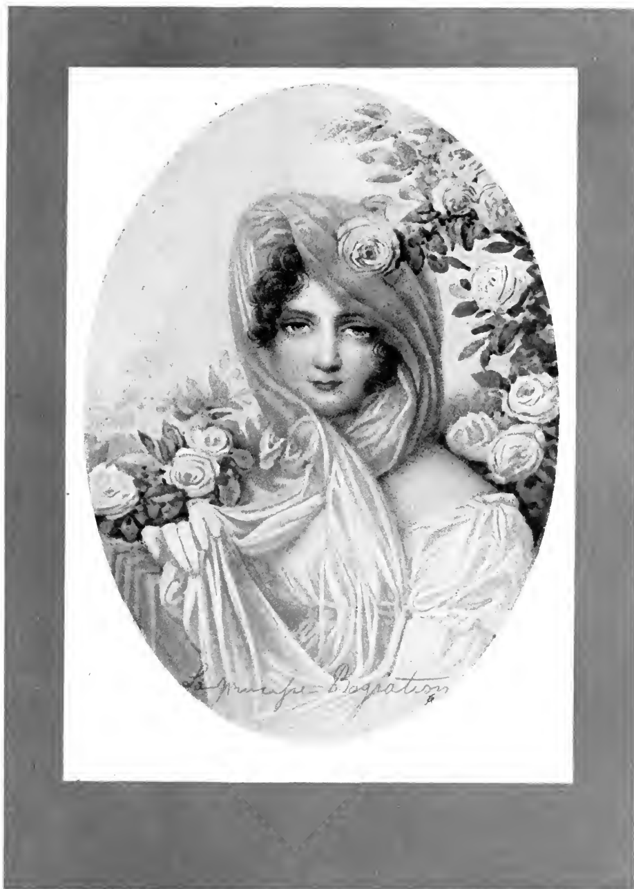
FÜRSTIN KATHARINA BAGRATION SKAWRONSKA BY JEAN BAPTISTE ISABEY (1812)

PLATE XLII FÜRSTIN KATHARINA BAGRATION SKAWRONSKA BY JEAN BAPTISTE ISABEY (1812)